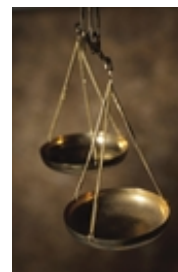
The Yield Difference

Though there are variations on the method, the original model compares the yield on the 10-year Treasury note to the forward-earnings yield per share of the S&P 500. Earnings yield is calculated in much the same way as dividend yield is: by dividing the per-share earnings forecast (rather than the anticipated dividend) for the next 12 months by the current share price. If the result is lower than the yield to maturity on a 10-year Treasury note, stocks might be overpriced. Why? Because the Treasury note offers a higher yield that involves less risk. On the other hand, if the forward-earnings yield on stocks is higher, then you're at least being compensated for the higher risk involved with stocks.