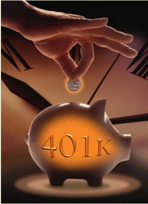
A number of retirement plan and IRA limits are indexed for inflation each year. Many of the limits have increased for 2012.

Many retirement plan and IRA limits are indexed for inflation each year. Some of the key numbers for 2012 are discussed below.